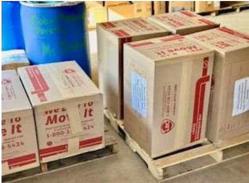
Barrels (Sierra Leone)